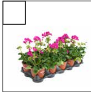
The logo for 'wave PETLINIAS' is shown in a stylized pink font. Below it, a black and white photograph shows a tray of several small pots containing purple petunia seedlings. A small pink cup is also visible in the bottom right corner of the image area.