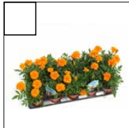
Marigolds add a pop of colour and brightness to enjoy all season. Excellent companion plants for many vegetables!

Colours: Purple, White Cannot mix & match colours in a flat