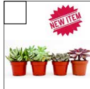
Fast-growing in popularity, succulents are versatile & low maintenance. Ideal as house decor and gifts! This 10-pack offers excellent variety and textures from the echeveria, sedum, sedeveria and senecio families.