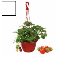
A kid favourite! Enjoy fresh strawberries all summer long. Ever bearing strawberries with different coloured blossoms in white or pink. Beautiful and delicious!