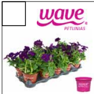
The popular cascading Wave petunias bring eye-catching colour to gardens, planter boxes and hanging baskets.

Colours: Red, White, Pink Cannot mix & match colours in a flat