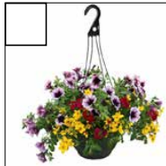
Our improved flower mixes are sure to be a big hit! These hanging baskets can be exposed to full sun with the best flowering and trailing plants. There are a variety of mixes/colours.