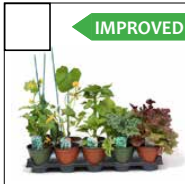
Grow your own food this year in a garden or planter box! Varieties include: