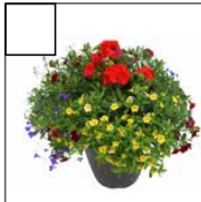
All planters include an assortment of our top performing plant collections. Planters can be exposed to full sun areas. Perfect for creating a spring patio or backyard paradise.