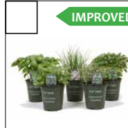
An assortment of our finest herbs! Varieties include: