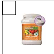
Enhance your garden with an easy to use fertilizer shaker. Made with organic granular kelp this blend is great for both flowers and veggies.