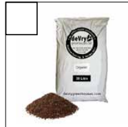
A bag of organic potting soil, perfect for filling containers. This hearty mix helps plants grow to their full potential. Enriched with: compost, kelp, fish meal, peat moss, glacial rock dust, & rice hulls.